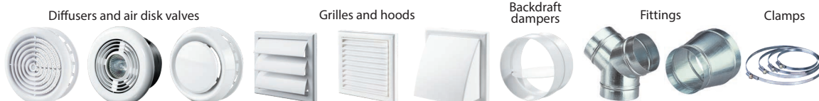
Diffusers and air disk valves