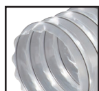
Transparent ( )