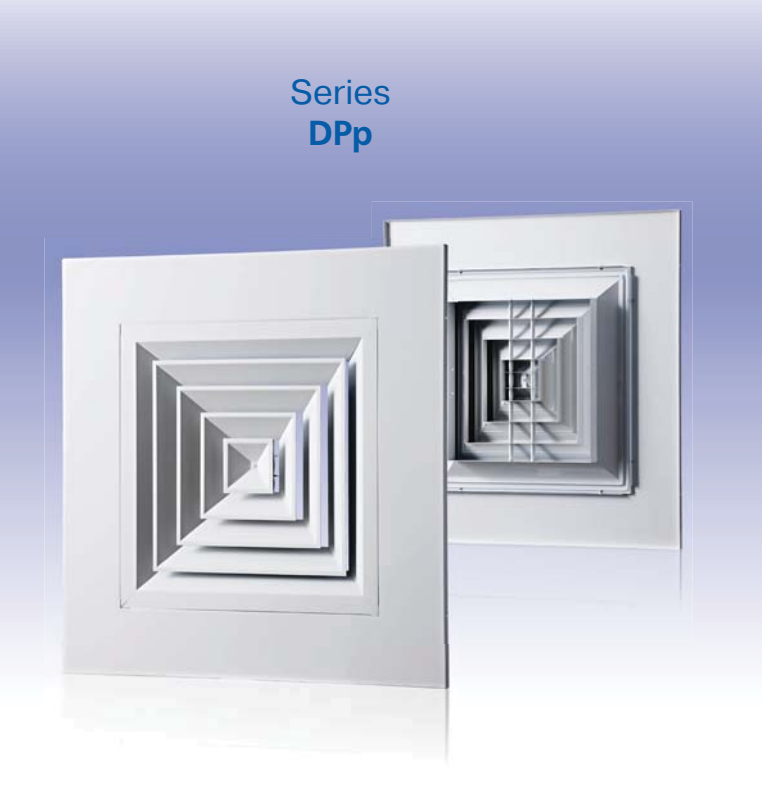
Ceiling diffuser with fixed vanes