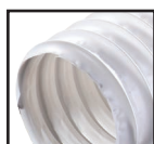
White ( )